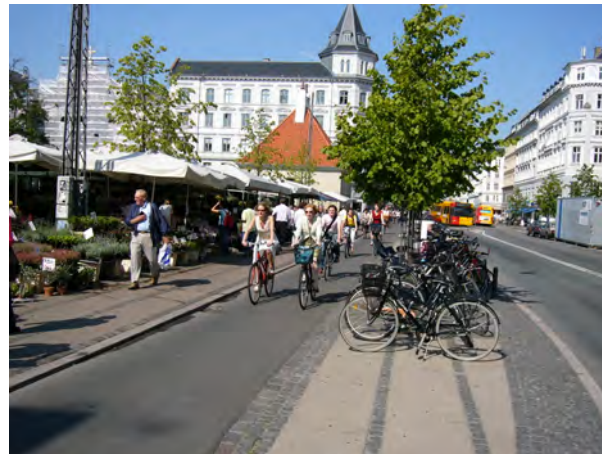
Safe cycle lanes encourage commuters, children and shoppers to travel by bike (Copenhagen, Denmark)