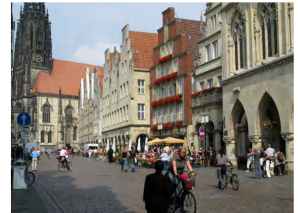
Worldwide, the trend is to create people-friendly city centres that are proven to be good for shops and tourism (Munster, Germany)

For more information about CRAG, its activities and contact details, please refer to our web site at www.capitalrail.org.uk