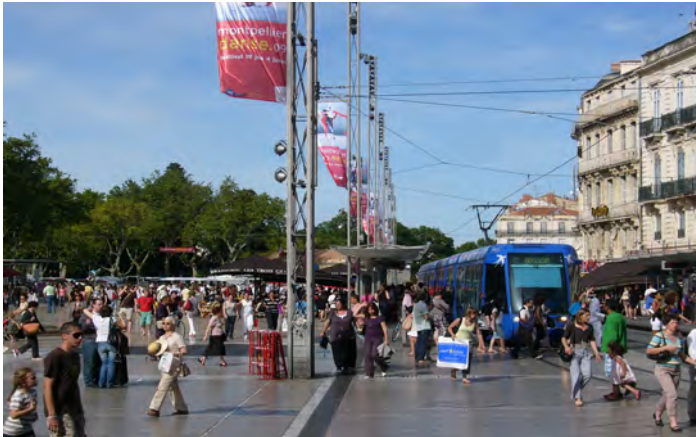
Modern trams allow a city to enhance its streets and recapture space for people (Montpellier, France)

It is also an ideal location for those travelling from/to points west and north by rail to interchange with the many passing buses.